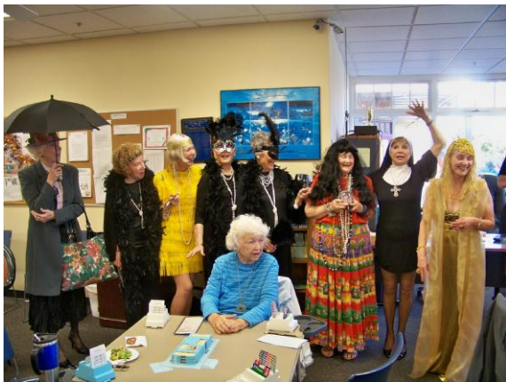
You can guess who is who by the smiles!